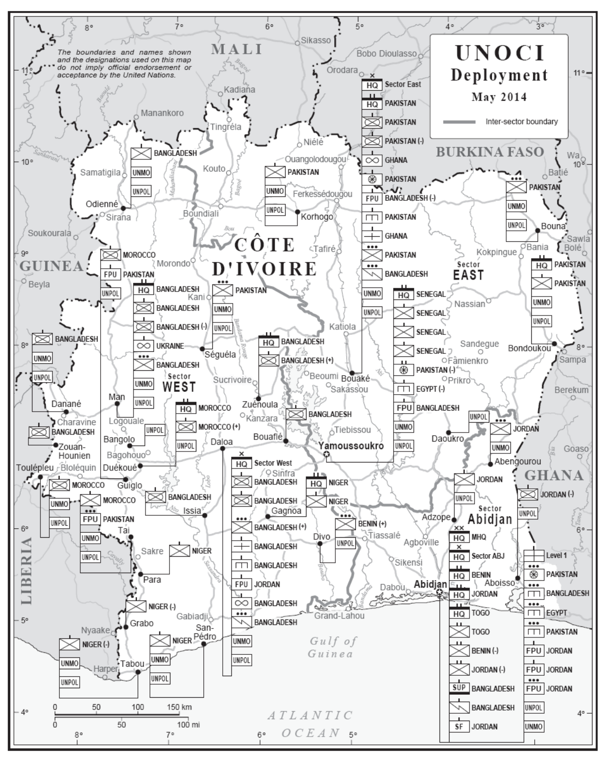
Map No. 4220 Rev. 50 UNITED NATIONS May 2014

Department of Field Support Cartographic Section